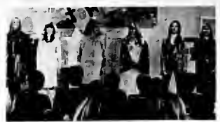
Scene from IU-PU's recent pep rally in the cafeteria.